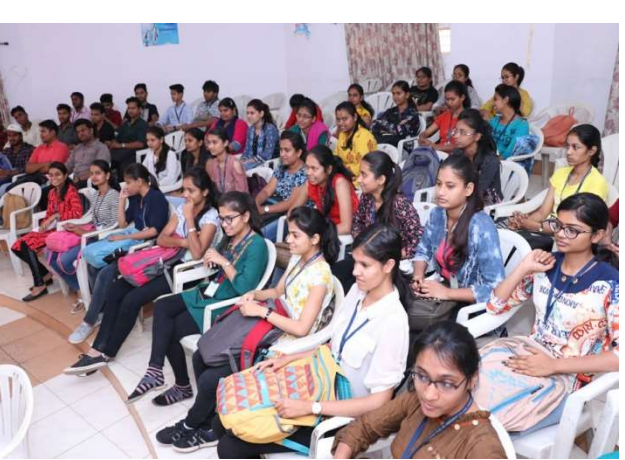
Students of Dept of Statistics participating in STAT-FEST