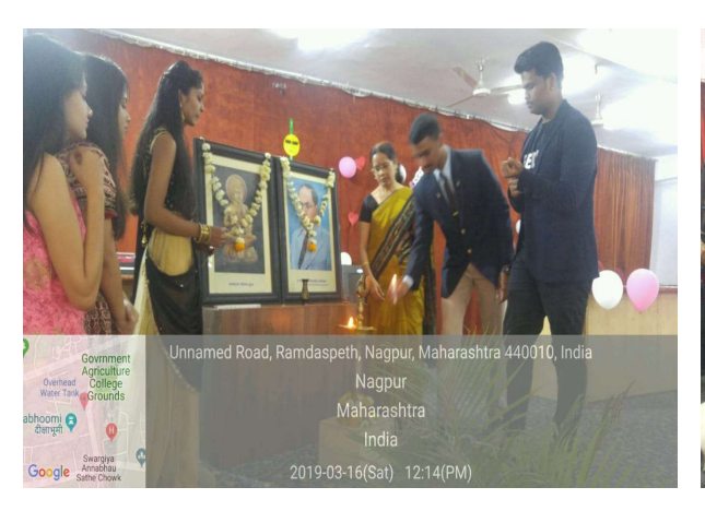
Students lighting the traditional lamp

The students of Department of Statistics organized cultural event competition as a part of Stat-Fest. The cultural events evoked an unprecedented response from student community. The enthusiastic students took lot of pains and invested a good amount of time and energy practicing for various events such as dance, singing, recitation of poems, fashion show and for planning various games. They enjoyed every minute of this event and participated in all activities whole heartedly.