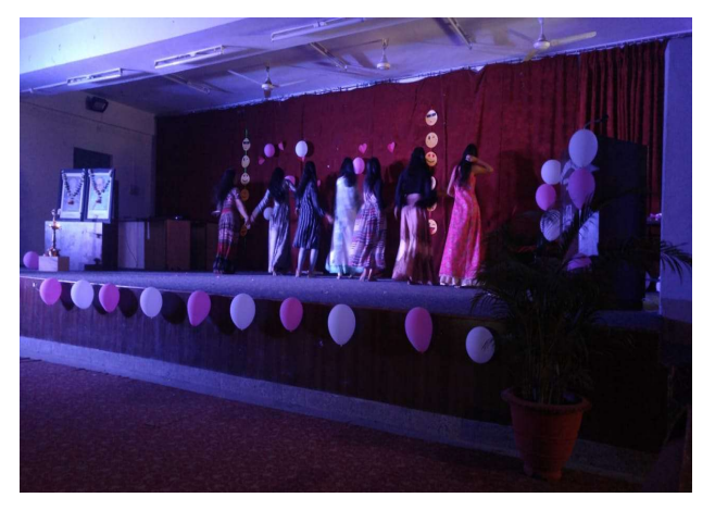
Dance performance by final year students