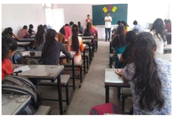
"STATABILITY" Competition 2018-19 in progress