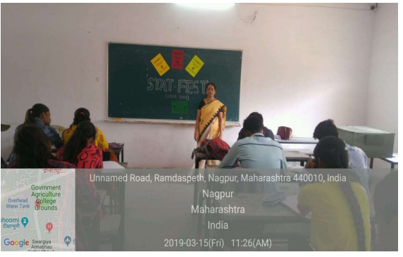
STATABILITY" Competition 2018-19 in progress