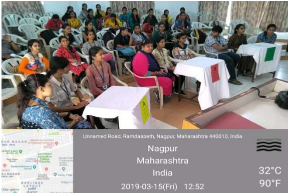
Participating Teams and the audience