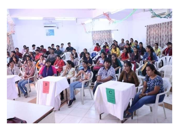
Participating Teams and the audience