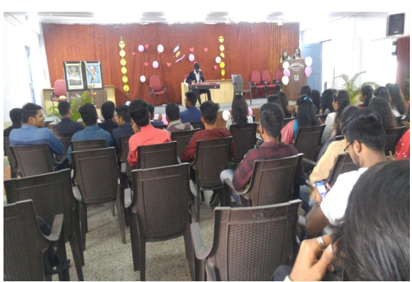
Instrumental music by Ankit Panchbhai.